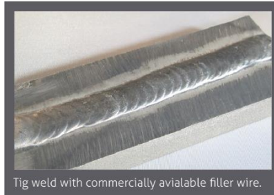
Tig weld with commercially available filler wire.