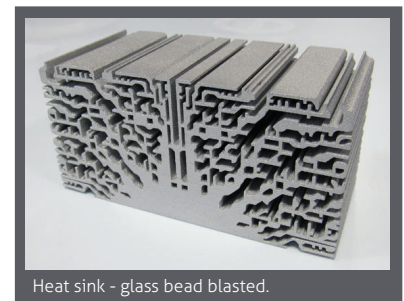
Heat sink - glass bead blasted.

All stated values are approximate values. All details given above are our current knowledge and experience, and are dependent on the equipment, parameters and operating conditions. The data provided in this document is subject to change and only intended as general information on a material set that is continually improving and developing. The data does not provide a sufficient basis for engineering parts. All samples were produced on an EOS M290. All tensile tests were performed at third party certified test labs such as Westmoreland Mechanical Testing & Research.